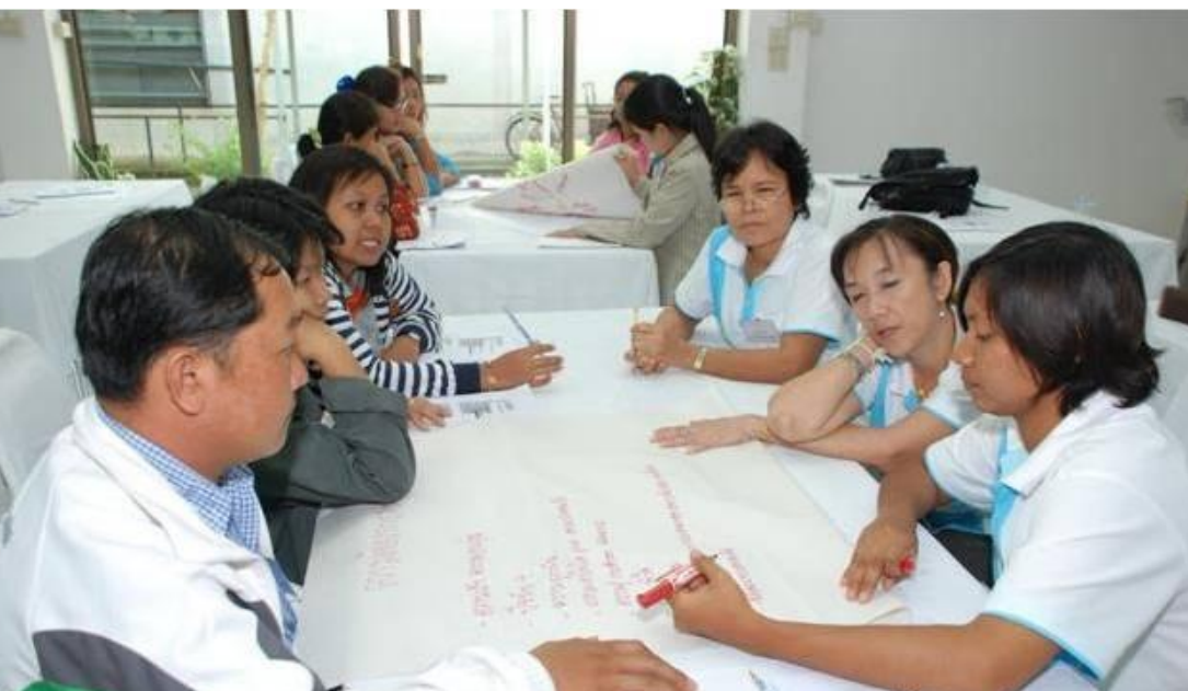
Participating in Case Studies

Thailand- Partnering with Christian Care Foundation for Children Disabilities, the Children at Risk Seminar was attended by 75 people, being responsible for 200 children. Participants included parents of children with disabilities, international and local volunteers, and government officials. As these photos show, we enjoyed an interactive learning environment. www.ccdthailand.org